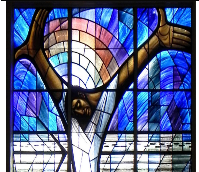
Wales Window for Alabama: Sixteenth St. Baptist Church, Birmingham