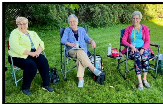
Grace Unit members, 60 th Anniversary Picnic, June 14, 2022