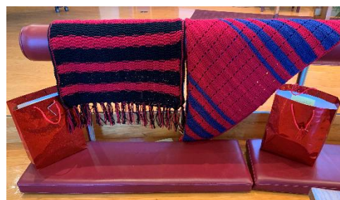
Shawls ready for presentation to the confirmands in October 2022.