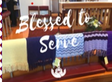
Prayer Shawl Ministry AUC creates hundreds of Prayer Shawls which are blessed and made available to anyone who is in need of comfort and encouragement.