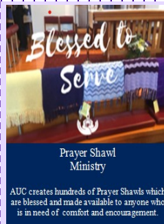
Prayer Shawl Ministry

https://www.auroraunitedchurch.ca/serve-at-aurora-united/aurora-community-cafe--61