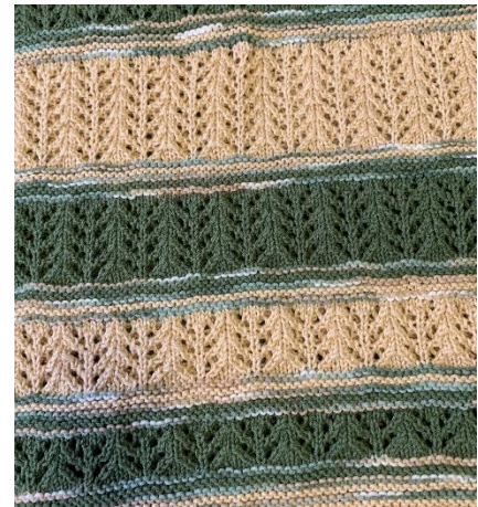
Gull Lace Stitch