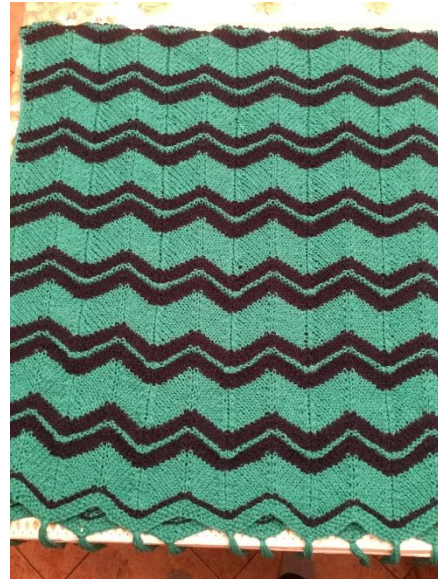
Ridged Chevron Pattern in two colours.