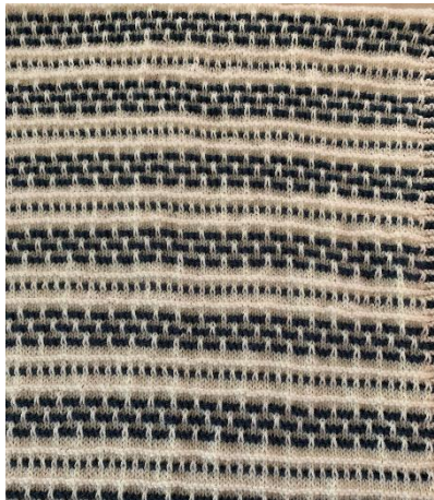
Woven Garter Stitch and Ribbed Basket Stitch